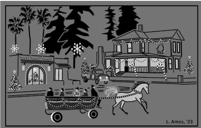
Black and white version of the VPA Christmas card.)