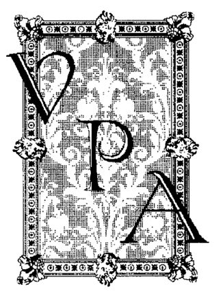
VICTORIAN PRESERVATION ASSOCIATION of Santa Clara Valley